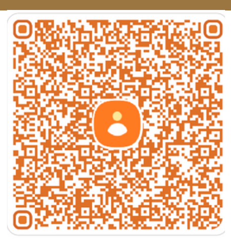
Add us to Contacts using QR Image